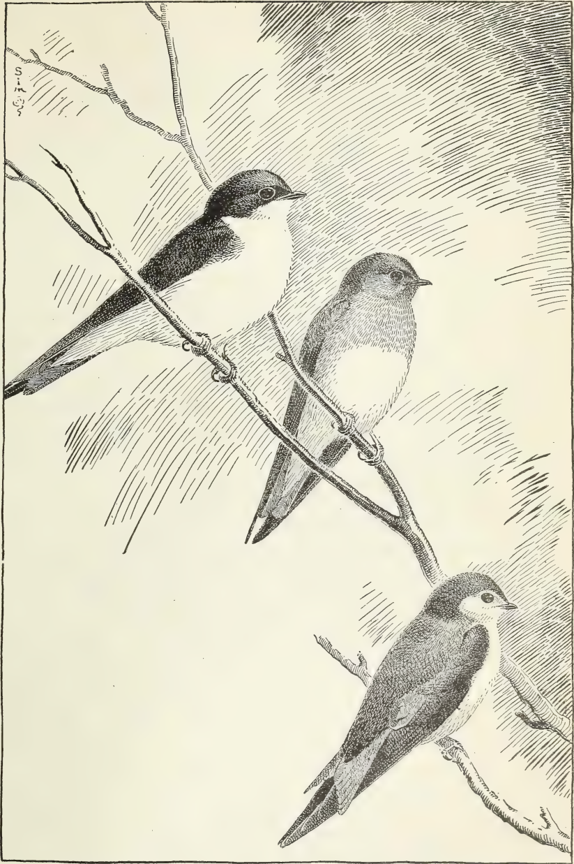
TREE SWALLOW (UPPER), ROUGH-WINGED SWALLOW (MIDDLE), AND VIOLET-GREEN SWALLOW (LOWER).